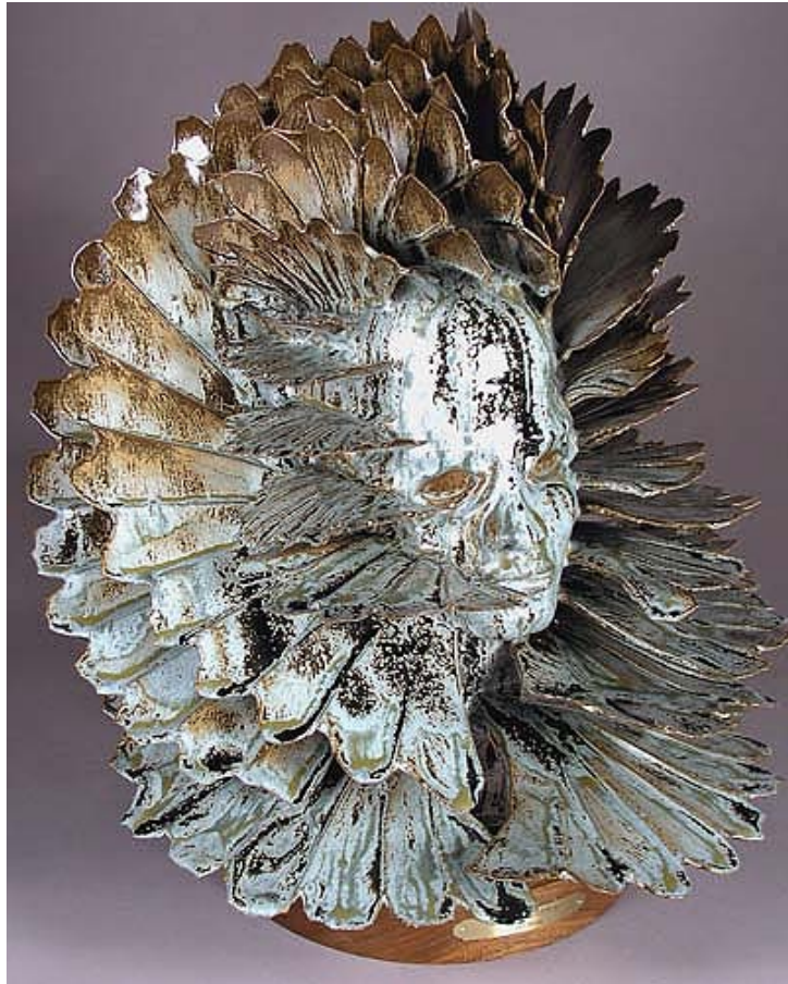
ABSTRACT CERAMIC SCULPTURE by Larry Boyer "Silver Leaf" Size: 18h x 15w x 14d inches.